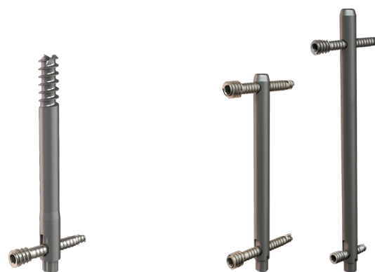
DYNANAIL HYBRID™ FUSION SYSTEM