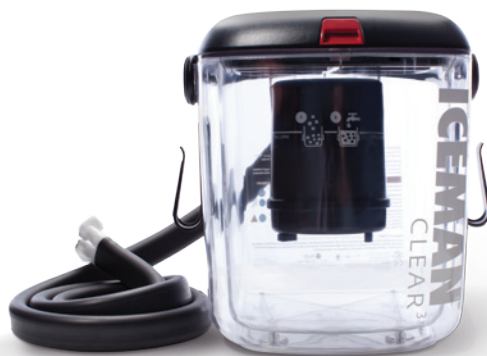
ICEMAN® CLEAR 3