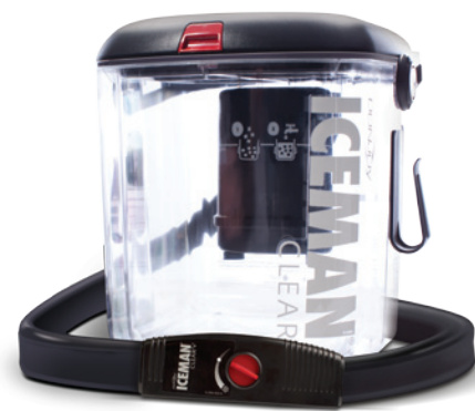
ICEMAN® CLEAR 3 +